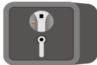
Safe or lockbox for handguns

Gun safes can lower the risk a curious child will be hurt: